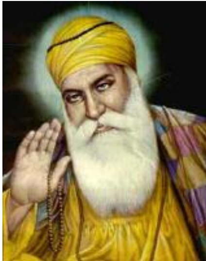
Guru Nanak (Sikh)

The Universal Spiritual Journey as seen in quotes from many religions