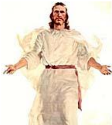
Jesus Christ (Christian)

Being asked by the Pharisees when the kingdom of God was coming, he answered them, "The kingdom of God is not coming with signs to be observed; nor will they say, 'Lo, here it is!' or 'There!' for behold, the kingdom of God is within you."